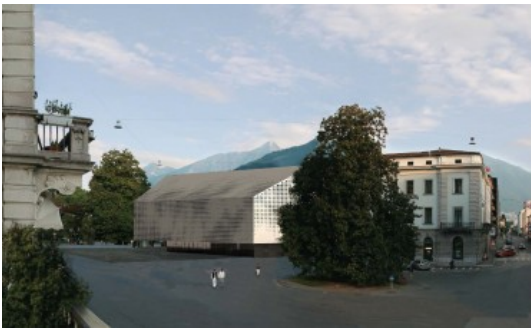
PROJECT BY TILL THOMSCHKE: EXTERIOR VIEW.

Locarno's public park in the city centre is one of its main open spaces, establishing a relationship on one hand, between the old town and the XIXth century city extension in the Maggia's delta and on the other, between the Lago Maggiore and the Piazza Grande, the main location of the Locarno Film festival.