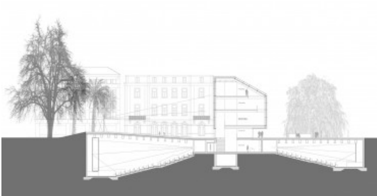
PROJECT BY TILL THOMSCHKE: SECTION.