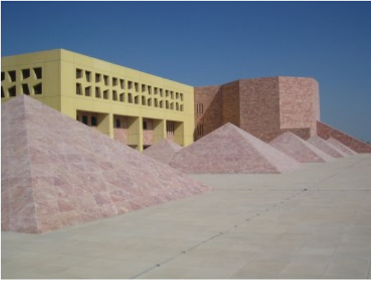
LEGORETTA'S TEXAS A & M ENGINEERING COLLEGE AT THE EDUCATION CITY