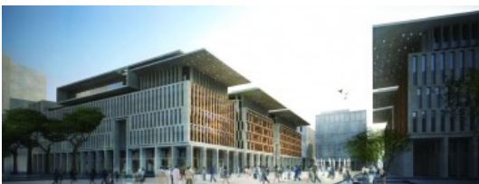
AL-BARAHAT SQUARE BY MOSSISSIAN & PARTNERS