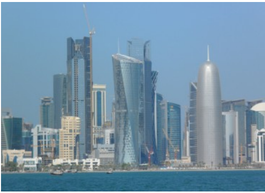
DOHA'S WEST BAY BUSINESS DISTRICT