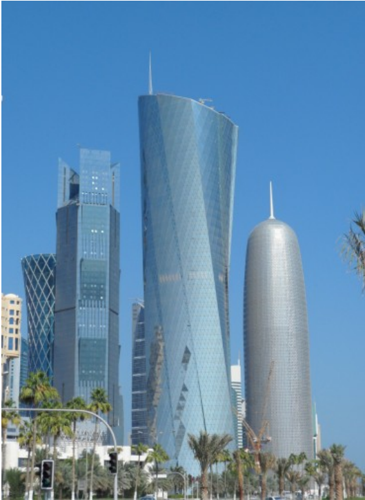
MULTIPLE PERFORMERS COMPETE IN CREATING A UNIQUE URBAN IMAGE