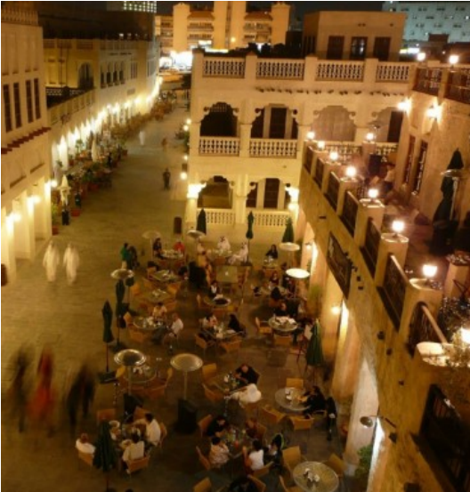
SOUQ WAQIF AT NIGHT, A SUSTAINED VIBRANT URBAN SPACE