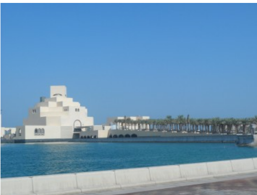
I.M. PEI'S MUSEUM OF ISLAMIC ART

nation of different societies, from the Atlantic ocean to the Arabian sea, bound together by common linguistic, cultural, religious, and a shared historical heritage. There is also an indirect influence of 'Islamism,' that offers an ideology which largely displaced 'Pan-Arabism.' Across the Gulf, the influence of 'Islamism' may also be seen as coming from Contemporary Persia as it used to flow in the past.