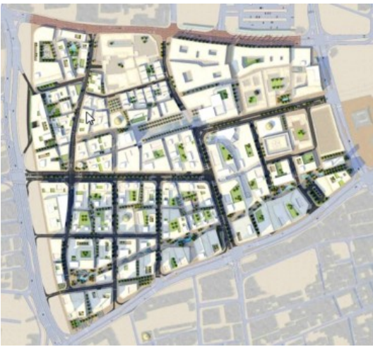
MSHEIREB URBAN REGENERATION MASTER PLAN BY A CONSORTIUM OF AECOM, ALLIES AND MORRISON ARCHITECTS, AND ARUP