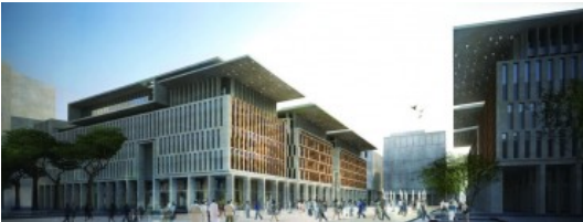
AL-BARAHAT SQUARE BY MOSSESIAN & PARTNERS (SOURCE: ©MOSSSIAN & PARTNERS)