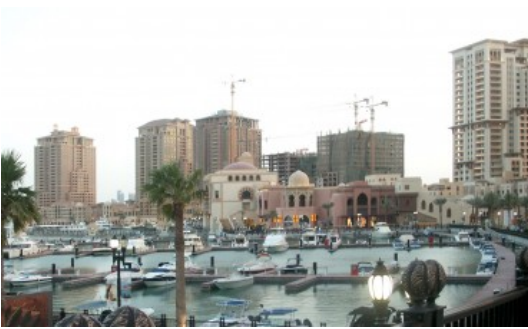
THE PEARL DEVELOPMENT: A NEW LIFESTYLE FOR AN EXCLUSIVE SEGMENT OF SOCIETY