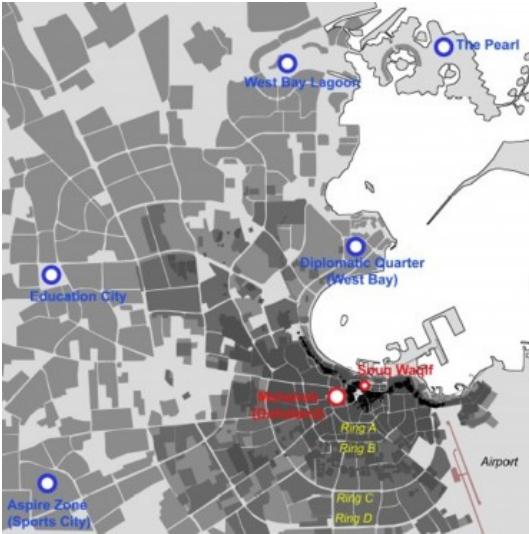
DOHA NOW: THE REACTION AND RESULT OF THE GLOBAL CONDITION