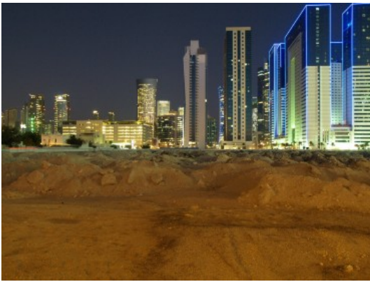
DOHA, DESERT AND CITY