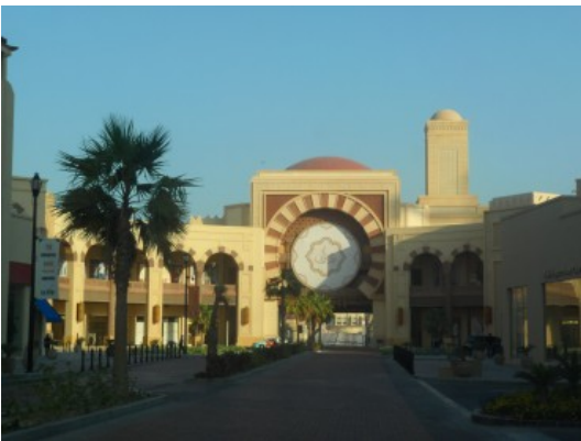
THE PEARL DEVELOPMENT: ECLECTIC MEDITERRANEAN AND EUROPEAN STYLE UTILIZED FOR IMAGE MAKING

developed from traditional Arabic mosaics that are evocative of the crystalline structure of sand. This was based on intensive studies to abstract the essential characteristics of the context while introducing new interpretations of geometric patterns derived from widely applied traditional motives.