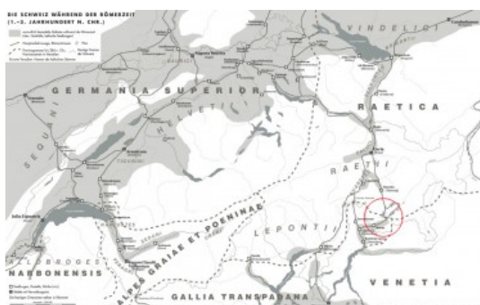
3. HISTORIC MAP OF SWITZERLAND 100-300 AD, MARCO ZANOLI 2006.