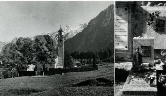
6. BORGONOVO CEMETERY

contrast to his father Giovanni and his uncle Augusto representing the specific conditions of light and nature with spectacular perspectives, Alberto often chose banal viewpoints out of the windows to capture the traces of reality. (5) The same tradition of the relatedness to family and geographical origin continues with the "tomba di famiglia" in the cemetery of the San Giorgio in Borgonovo, the neighbour village of Stampa. (6)