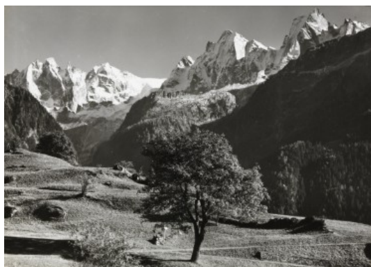
1. VIEW TO SCIORA-GRUPPE, PIZ CENGALO AND PIZ BADILE, OTTO FÜRHTER VERLAG.