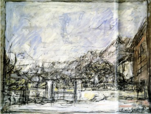
5. LANDSCHAFT BEI STAMPA, 1952. ALBERTO GIACOMETTI. BÜNDNER KUNSTSAMMLUNG CHUR.