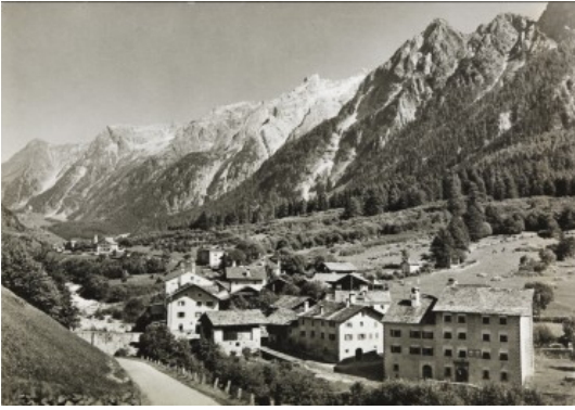
4. VILLAGE STAMPA, FOTO BERNHARDT, HUTTWIL.