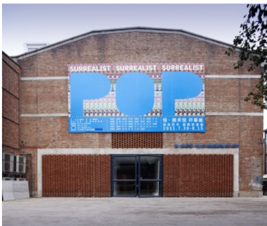
YUE ART GALLERY