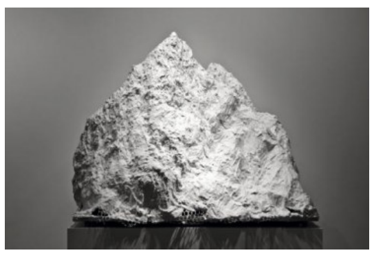
PIS AJüZ, NOT VITAL