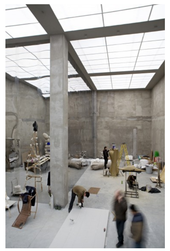
ATELIER NOT VITAL BY MITSUNORI SANO