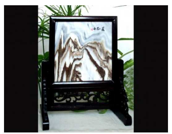
TRADITIONAL CHINESE ART MADE OUT OF DALI STONE

the life more liveable. Sometimes Not makes sculpture that make you laugh. There is not a lot of architecture that makes you laugh. It is always too serious. I would like to go in this direction where architecture can make one laugh.