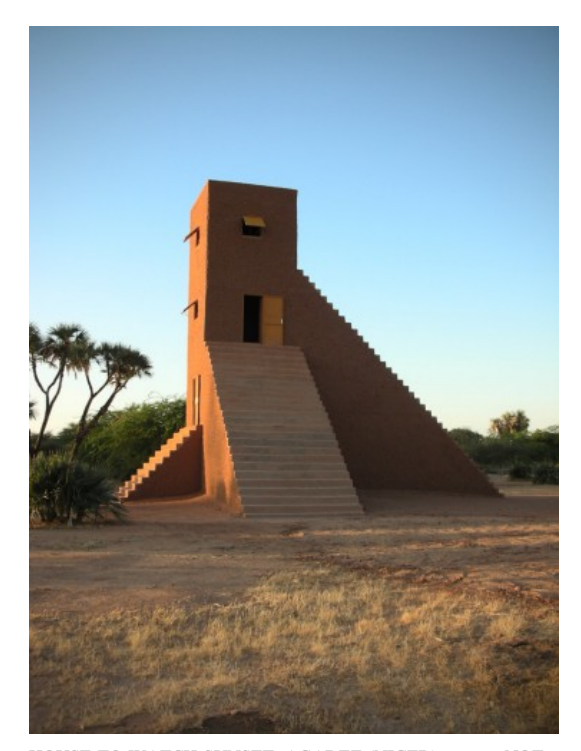
HOUSE TO WATCH SUNSET, AGADEZ (NIGER)