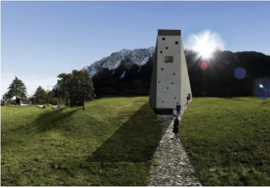
PROJECT BY NINA OZGUR: EXTERIOR VIEW.