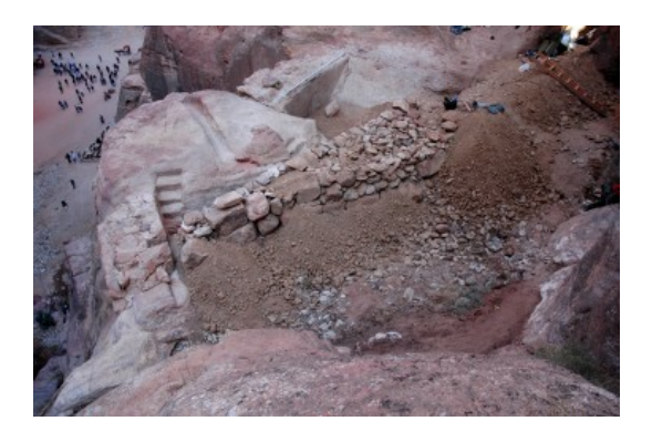
ARCHAEOLOGICAL EXCAVATION IN PETRA