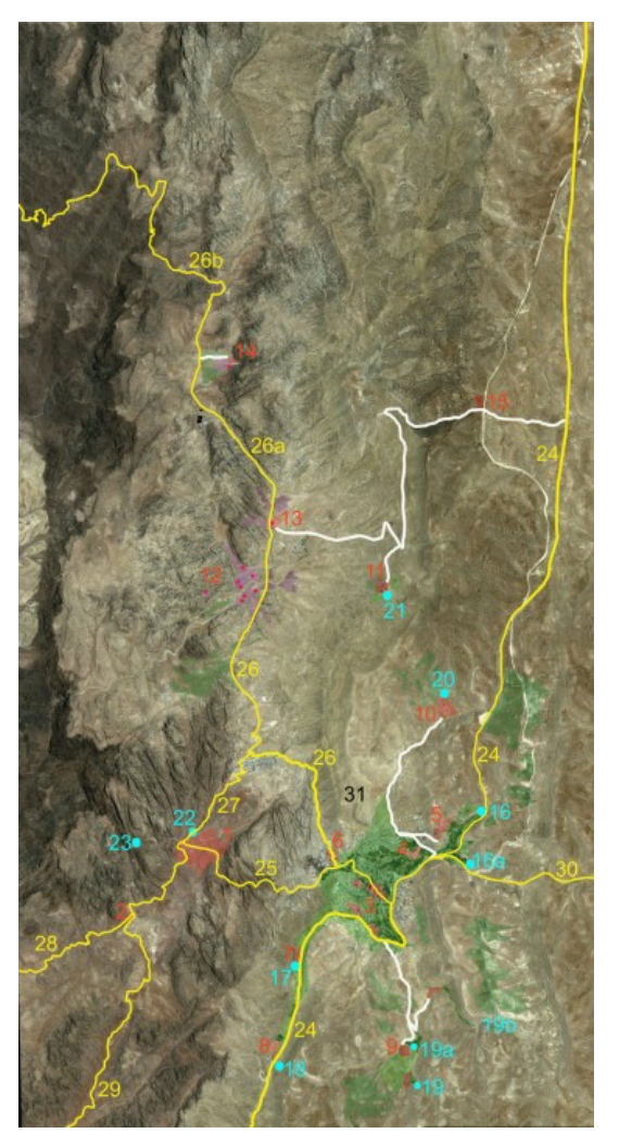
SATELLITE IMAGE OF PETRA AND ITS SURROUNDINGS WITH THE SETTLEMENTS, THE FOUNTS, THE STREETS AND THE AGRICULTURAL AREAS

4.7.2012 - ISSUE 6 - MIDDLE EAST 1 - BAUMGARTNER MARIANNE, BELLWALD UELI, IVANISIN KRUNOSLAV - INTERVIEWS