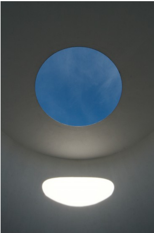
CAT CAIRN: THE KIELDER SKYSPACE, 2000