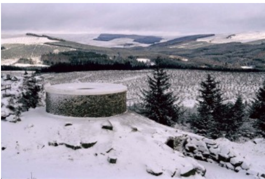
CAT CAIRN: THE KIELDER SKYSPACE, 2000