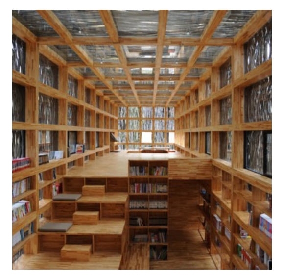
LI XIAODONG. LIYUAN LIBRARY, HUAIROU (BEIJING), 2011