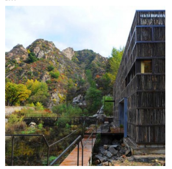
LI XIAODONG. LIYUAN LIBRARY, HUAIROU (BEIJING), 2011