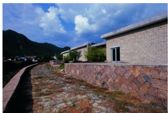
WANG LU. TIANTAI MUSEUM, TIANTAI, 2003

4.3.2013 - ISSUE 11 - MADE IN CHINA - WANG LU , WENYI ZHU, OBIOL CECILIA , XIAODONG LI - INTERVIEWS