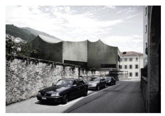
PROJECT BY TOBIAS TOMMILA: EXTERIOR VIEW