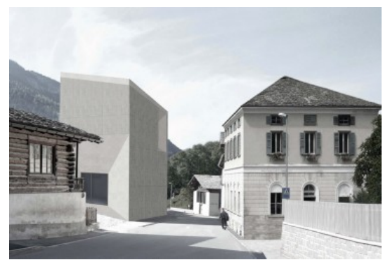
SITE I: THE ATELIER. PROJECT BY LEA STOCKER.