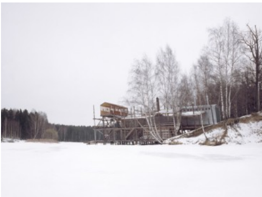
95° RESTAURANT, NEAR MOSCOW, ALEXANDER BRODSKY 2001

With the Ice Pavilion, the entire initial construction and subsequent dismantling process is a kind of ceremony of appearing and disappearing. The temporary/permanent opposition is probably at its strongest in this project: temporary material on a temporary ice surface.