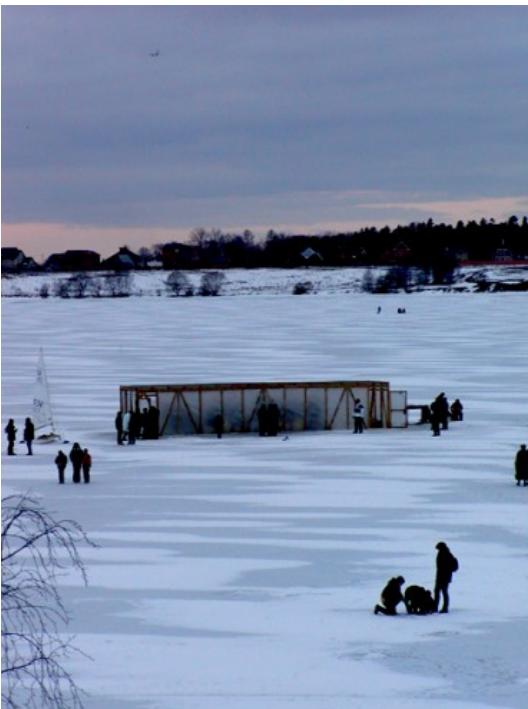
ICE PAVILION, KLYAZMINSKOYE RESERVOIR RESORT, ALEXANDER BRODSKY, 2004

95° Restaurant was conceived as a structure of the kind that is widespread in Russia - a temporary waterfront building with an unclear purpose - either a shed, or a boardwalk, or a wharf, or all three combined. These buildings are often neglected and deserted: as soon as they are not used any more, they are abandoned and fall into decay. This dictated both the look and the material, and even the structural concept. The location is in a developing resort on the edge of a water reservoir near Moscow. The brief required a summer restaurant with a simple structure built with cheap materials. Thus, the choice was obvious: materials that are habitually used for temporary building in Russia - wood, plywood, perspex and galvanised steel.