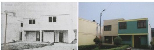
CHRISTOPHER ALEXANDER PROJECT IN 1978 AND 2003

PREVI considered and studied the desires and living patterns of future occupants of the project in the design process. The target was families of low-income who qualified for a low interest loan for the purchase of a small, basic first stage, contractor built house in one of the different clusters. All the international architects were brought to Lima for ten days to study the basic components of the program: the site, visited typical low-income families, squatter settlements, urban slums, government housing projects, met Housing Bank officials, examine materials and practices of the building industry. This program gave the architects an in-depth view of the problem as far as time and resources would permit. Later on sample houses in the different clusters of the neighborhood were open to prospective buyers before purchase.