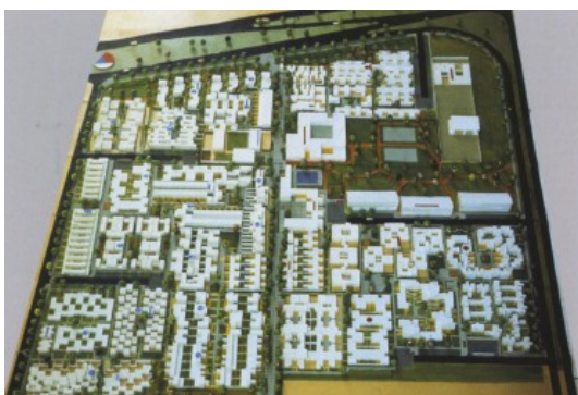
PREVI MODEL