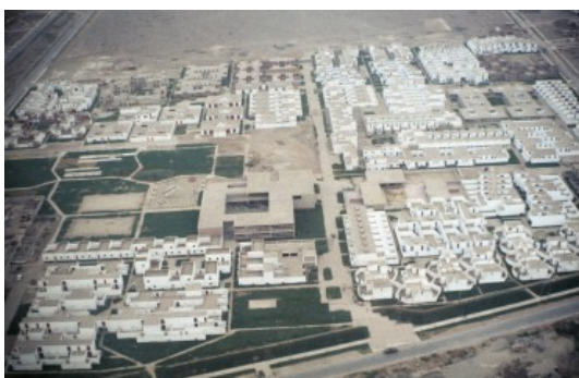
PREVI AERIAL PHOTOGRAPH, 1976