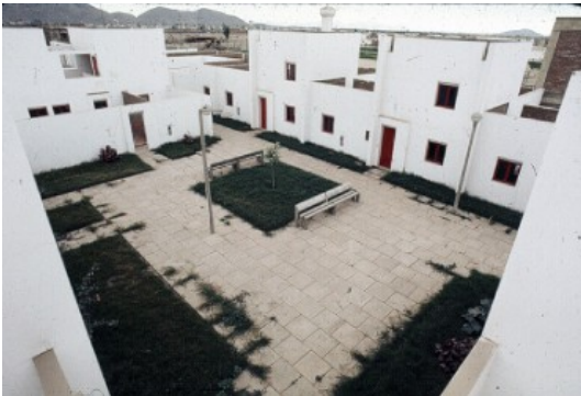
GERMAN SEMPER PROJECT IN 1976