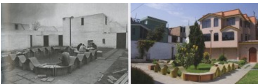
ALDO VAN EYCK PROJECT IN 1978 AND 2003