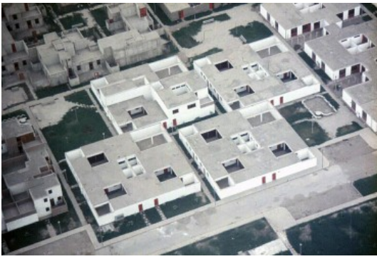
JAMES STIRLING PROJECT IN 1976