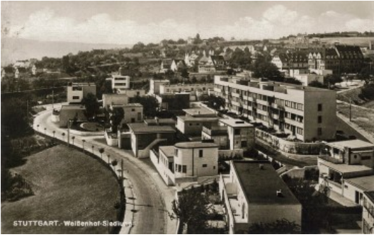
WEISSENHOF SIEDLUNG, STUTT GART, 1927

environment. The reality of collective and experimental action focused on a growing global need for urban social housing is fundamental for political and social stability, and it is not limited to the Third World. If schools of architecture are to embrace these realities and train students to understand, work and contribute to these very exciting new challenges, the necessary components for this must be incorporated in a practical and realistic way in educational curricula and research to be effective. Such initiatives need to include inspiring young professionals and others with that unique combination of vision, practicality and a strong social conscience.