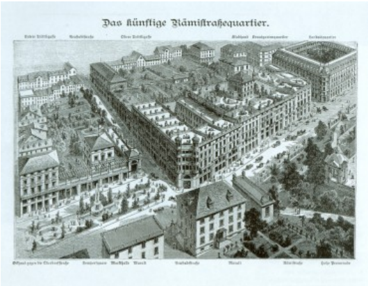
PROPOSAL BY HEINRICH ERNST (1880)