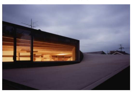
TREE HOUSE

area.' A bright depth, beyond the reach of urbanism, is born in Tokyo.