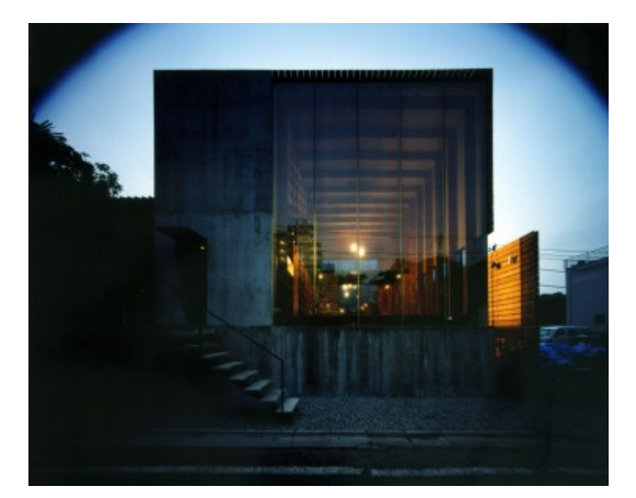
M3/KG - PHOTO BY RYOTA ATARASHI