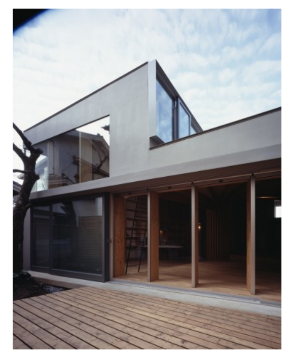
TREE HOUSE