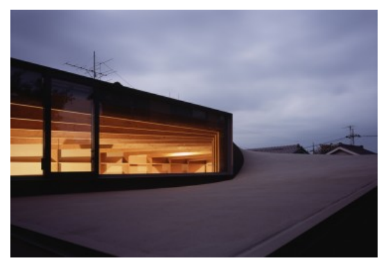
TREE HOUSE