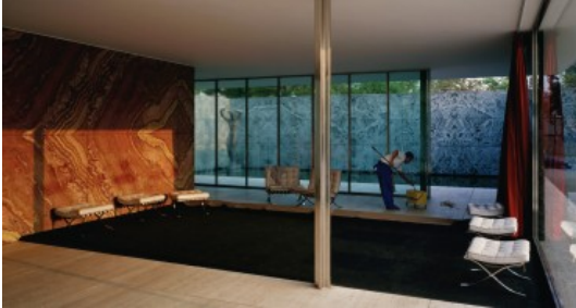
JEFF WALL, MORNING CLEANING, MIES VAN DER ROHE FOUNDATION, BARCELONA, 1999