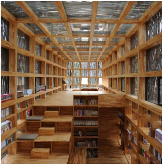
LI XIAODONG. LIYUAN LIBRARY, HUIAIROU (BEIJING), 2011