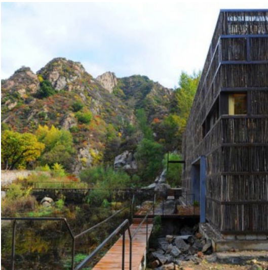
LI XIAODONG. LIYUAN LIBRARY, HUIAIROU (BEIJING), 2011